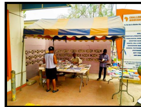
Outdoor Bonanza Bookstand

16. BONANZA SALES: Pray for patronage of books that have been reduced to clear.