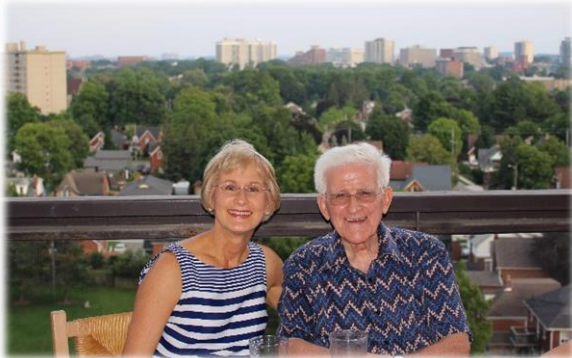
Dad & me enjoying supper on his balcony – July 2018

Dad has had a good year, especially as we remember how challenging his health journey was in 2017. His pace has slowed somewhat, but he continues to walk most days a week. In addition, he is now doing a circuit of exercises at a seniors centre fitness facility about 3x a week. Lately I've been happy to notice a bit more spring in his step as well! We had a lovely summer, weather-wise, and Dad made the most of it by entertaining dinner guests most weeks. Eating out on his balcony was a perfect setting – even on very warm evenings you can usually catch a welcome breeze up on the 11 th floor! And in the early summer Dad might have even treated you to his balcony-grown lettuce. In September Dad was able to make a short, but most enjoyable, trip out to Alberta to visit with Mum's family. It was a warm time of reconnecting in spite of the unexpected and early snow. Dad just passed another driving exam – always a welcome milestone that will hopefully have him driving safely for another two years. Dad's local church, Northside Community, has just hired a new pastor which is good news all round. Dad continues to read voraciously and is even, with effort, expanding his personal supper recipe repertoire – adding a few things like stir fries and cock-a-leekie soup. We continue to be grateful for Dad's wonderful neighbours and friends