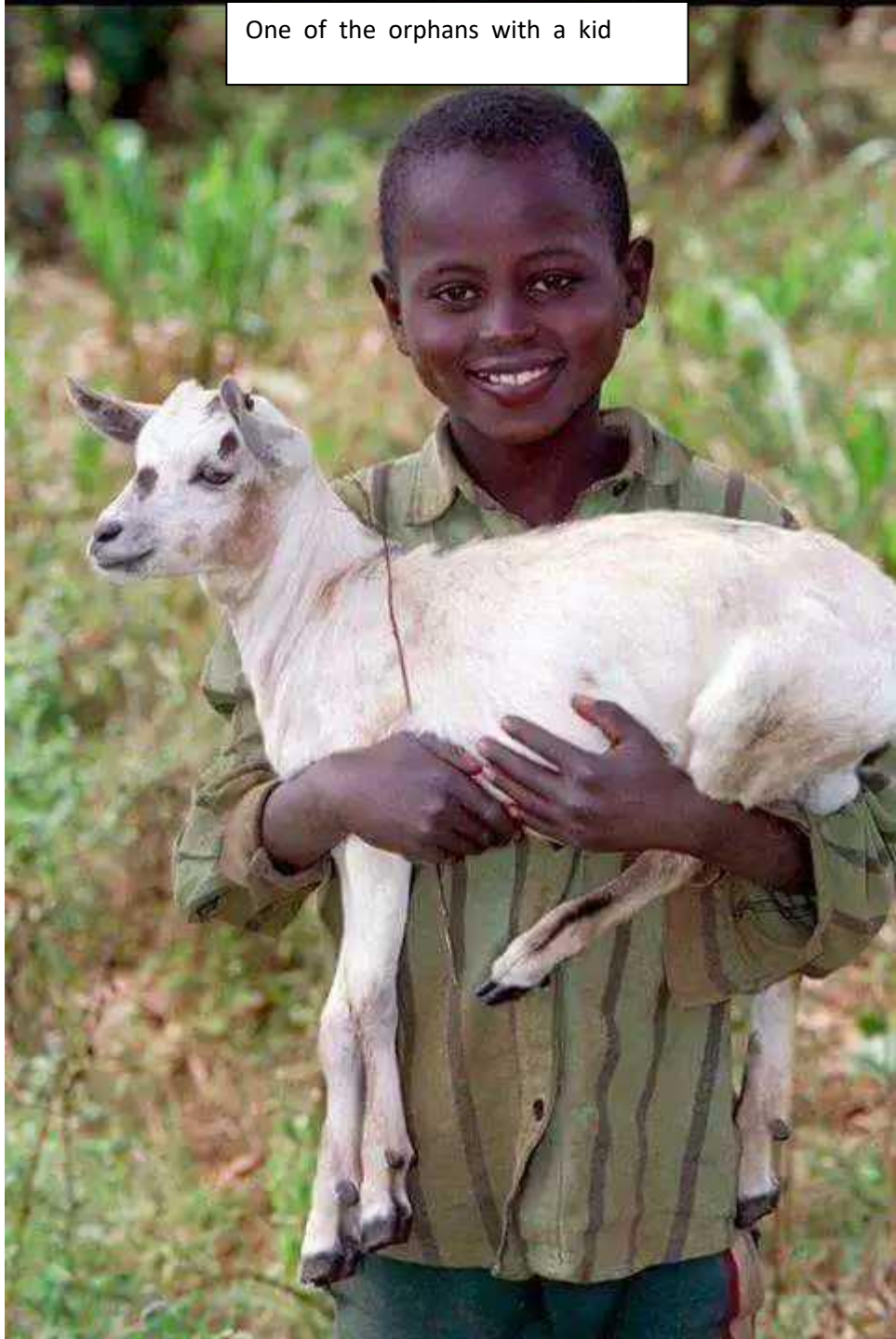
One of the orphans with a kid