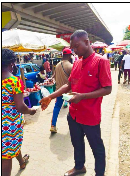
Tract Distribution in Accra

6. CEG FINANCES: Pray for good health for the CEG finance team - and that their dedication will lead to sound financial management.